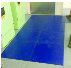
ITDecom Tiles installed in Royal Bank of Scotland Data Centre.