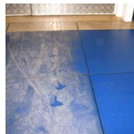
The dirt collected by contractors working in Tesco's Data Centre.