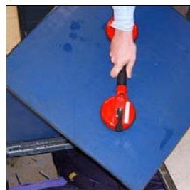
ITDecom Tiles can replace individual access floor tiles.